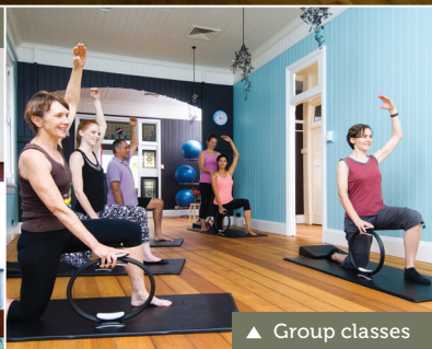
▲ Group classes